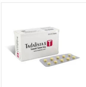
TADALISTA 5 MG