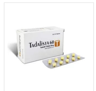
Tadalista 60 mg