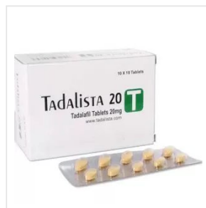
Tadalista 20 mg (Tadalafil)