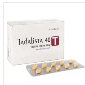
Tadalista 40 mg